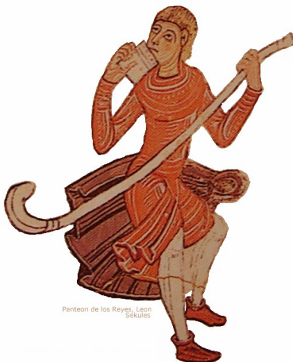
Panteon de los Reyes, Leon Sakulcs