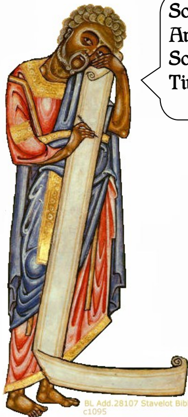
BL Add.28107 Stavelot Bible c1095

The rest of the meeting was devoted to scheduling. (See page one.) None of the dates are cast in Jello, but at least we can have some idea of what to expect.